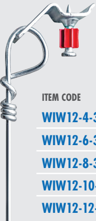
ASTM Hot-Dip 12g Pre-Tied Wire w/ 1" Pin/Ceiling Clip

WIW ASTM Hot-Dip 12 gauge wire in lengths of 4', 6', 8', 10' and 12' pre-tied with our most popular 1" and 1-1/4" Pin/Ceiling Clips are standard. Contact us for real time inventory and availability of pre-tied wire types and custom options.