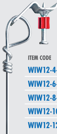
ASTM Hot-Dip 12g Pre-Tied Wire w/ 1-1/4" Pin/Ceiling Clip